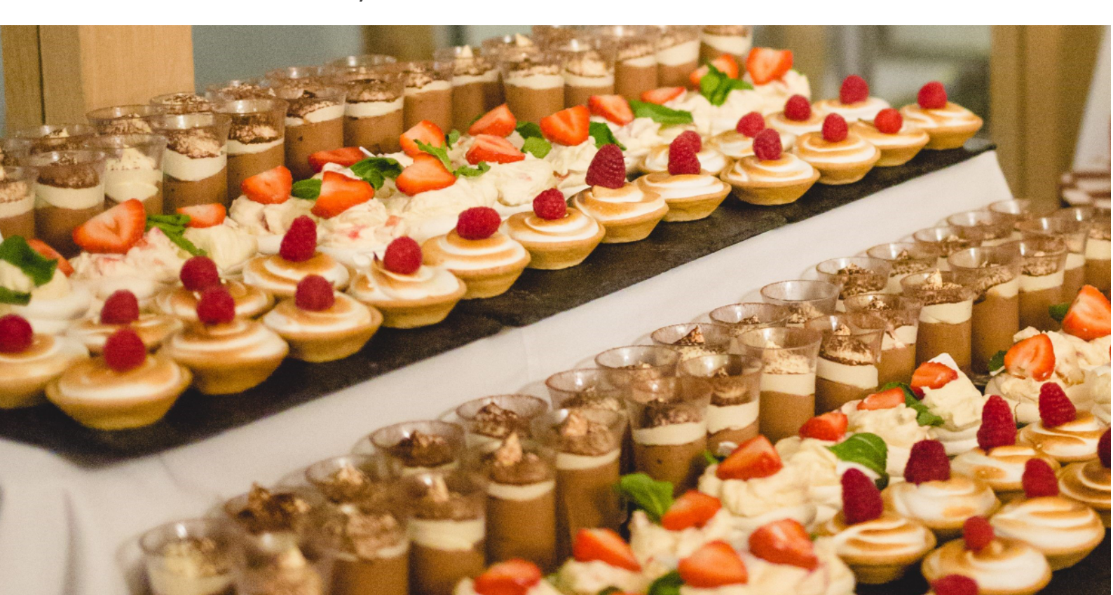
£34.50 Per Person Tea, Coffee and Petit Fours £2.50 Per Person

Strawberry Cheesecake (g,m) Chocolate Brownie (g,m,e) Lemon Meringue Tart (g,m,e) Raspberry Pavlova (m,e) Lemon Posset (m) White Chocolate Mousse (e,m) Apple Crumble Tart (g,m) Chocolate Profiteroles (g,m,e)